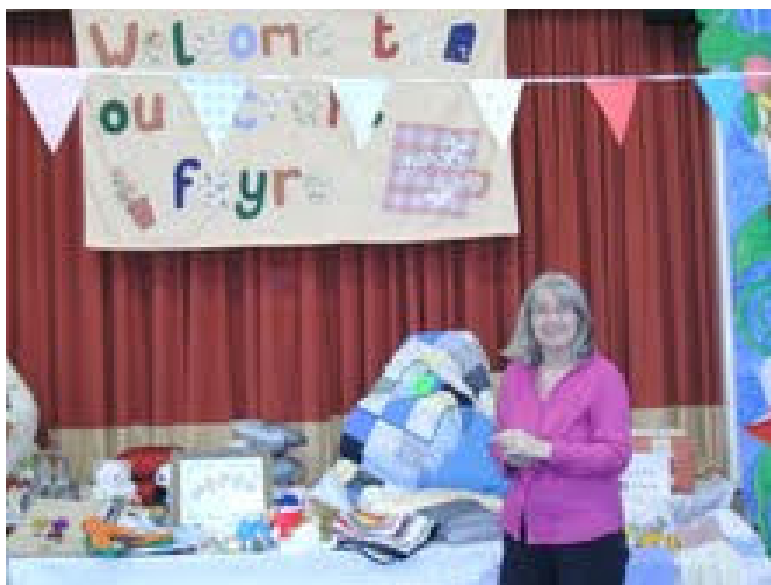
Summer Fayre 2012