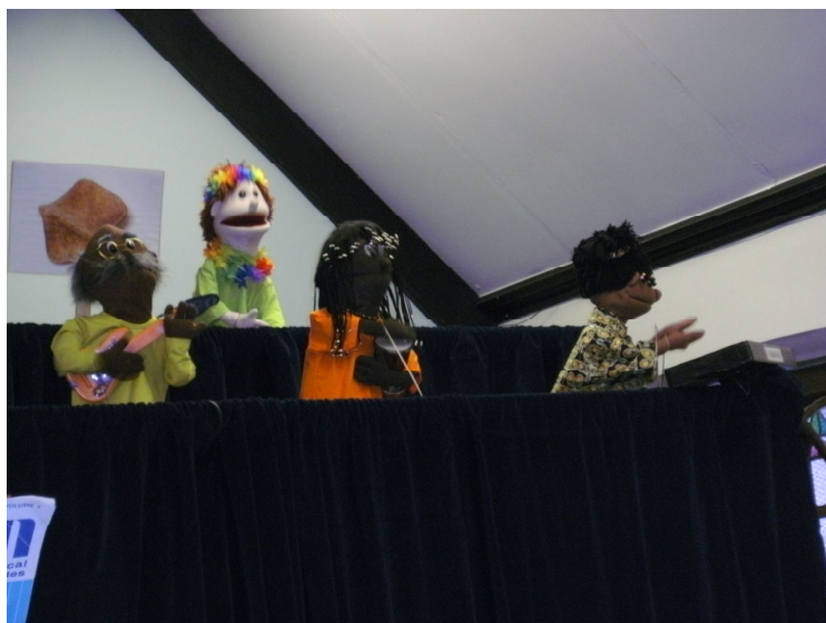
Fife St. Joint Fellowship Evening