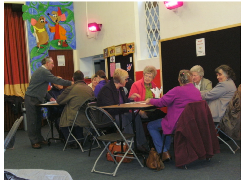
Lots of chatting at the coffee morning