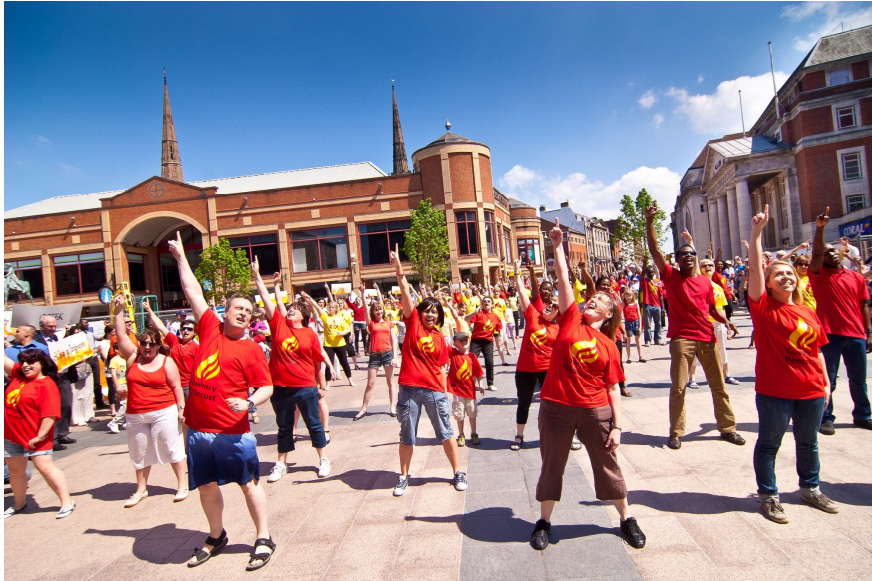
Tearfund coffee morning